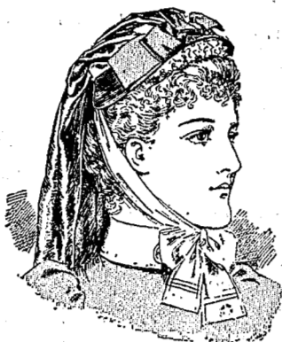
The "St. Bride's" Bonnet. Made of fine Straw with Lace and ruching, and trimmed with Ribbon, and long Silk Gossamer Fall. In black and colours, 12/6 each. Without Fall, 9/6; also