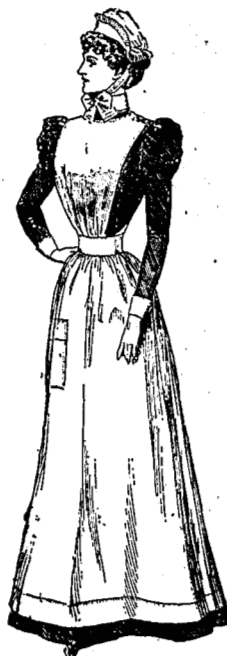
The "Rena" Apron. Made of linen finished Cloth lock-stitch throughout, 2/6 each. In two sizes, 36 in. & 39 in. from waist to hem.